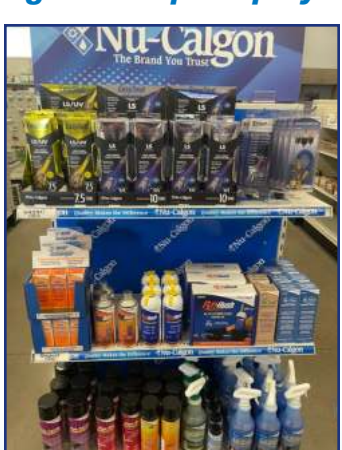
Here is another example of Gary renovating an end cap at Century in Mansfield, TX. The store manager thanked Gary for creating a fantastic display utilizing Nu-Calgon assets, header, shelf strips, and backers.