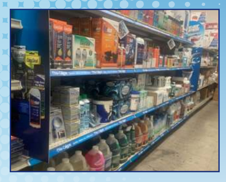
Organization, shelf strips, and shelf enhancers make all the difference in the world, as shown here in the before and after photos at the AC Warehouse