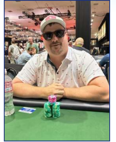
Good luck, Kid Maverick—we're all cheering for you!