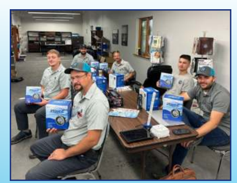
IAQ Training at Ascend Mechanical